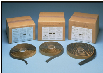
Above: The WATERSTOP RX RANGE