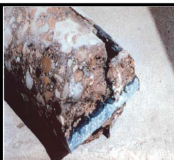
Below: The sealing abilities of WATERSTOP RX are clearly demonstrated on this badly vibrated concrete

Volclay Waterstop RX is a flexible strip construction joint wa-